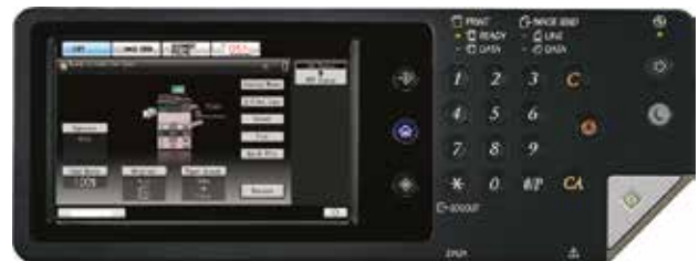
Easy to use LCD control panel ensures easy navigation

For smaller workgroups, the 26 pages per minute (ppm) MX-M266NV has plenty of power to handle your daily printing and copying requirements. Larger teams will appreciate the extra speed of the 35 ppm MX-M356NV and 31 ppm MX-M316NV. And everyone will love the crisp detail and fine line perfection that comes from the 1200 x 600 dpi resolution with 256-level greyscale.