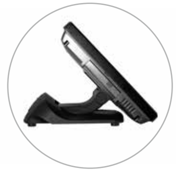
Low Profile Mode