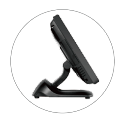
Full Extended Mode

The XT-3815-G2 provides the selection of two foldable bases, the curvy slim GEN7E base and the larger but practical GEN8E base. The foldable base can be configured into "Flat Folded Mode" to save the shipping package volume, "Low Profile Mode" to allow greater interaction between the cashier and the customer, and the traditional "Full Extended Mode". All this can be achieved with a simple pull of the hidden lever.