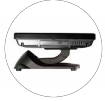
Flat Folded Mode