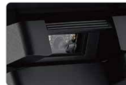
2D Barcode Scanner

Dressed from head to toe in timeless black or white color, the only trend that never goes out of style, and with stylish touches added throughout, the HS-6500 Series is not just a piece of machinery, it is an elegantly crafted piece of art that looks right at home in any store decoration.