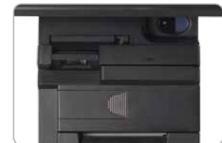
Optional Built-in MSR Fingerprint Sensor and RFID Reader