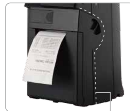
Detachable Receipt Printer

The HS-6500 Series integrates the most widely used peripherals including 3" thermal printer, MSR, fingerprint sensor, 2D barcode scanner and 2 nd customer display to support your daily POS operation. The detachable modularized design allows quick access to the components, enabling fast and easy service and upgrades.