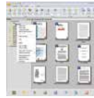
The PaperPort SE14 main screen

The Professional Choice to Organize and Share Your Documents