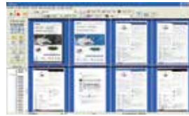
The AVScan X main screen

The Intelligent Document Management Tool