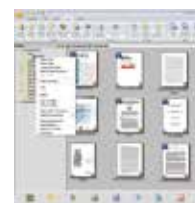
The PaperPort SE14 main screen

- The Professional Choice to Organize and Share Your Documents